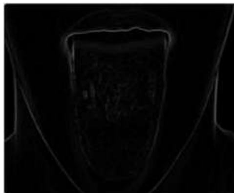
Fig2: Edge Detection