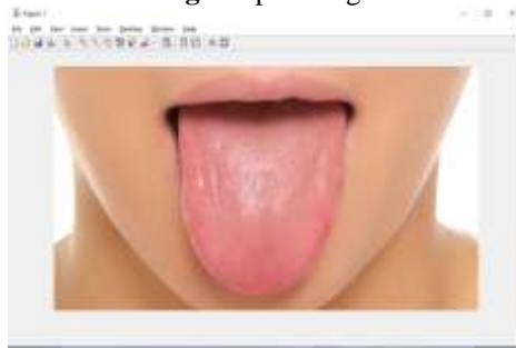
Fig1: Input Image